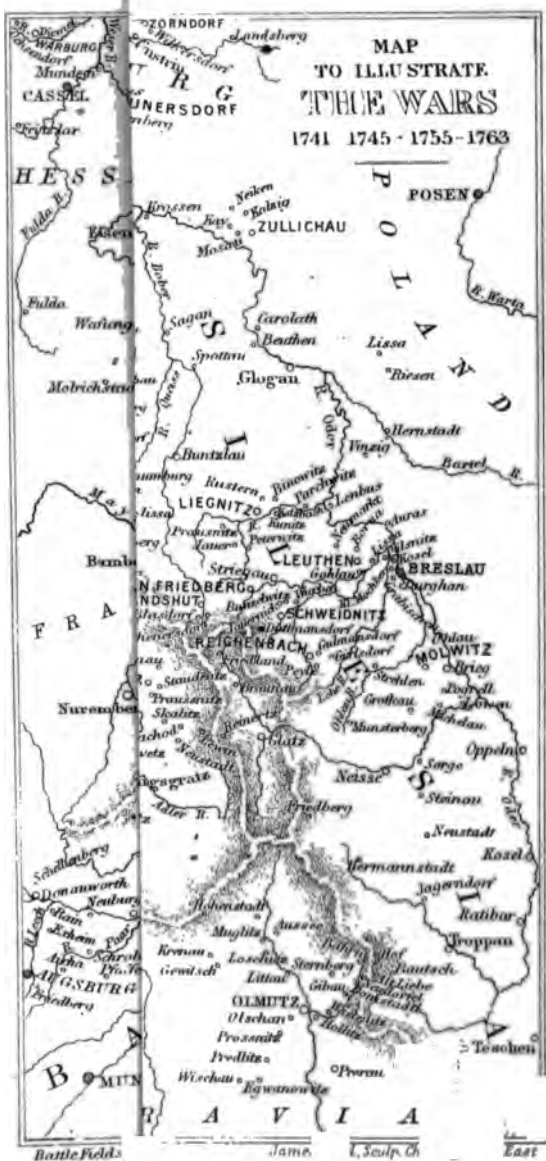
Battle Fields. Jame. I. Sulp. Ch. East